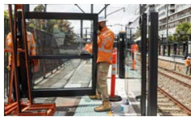
New platform screen doors are a key feature of Sydney Metro stations